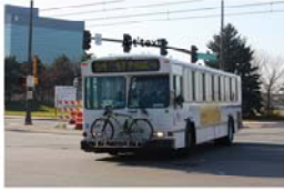
Alt text: a bus